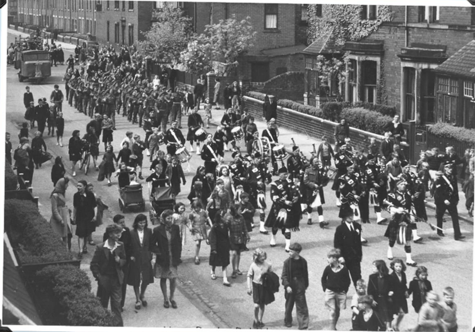
← Crowds gathered to celebrate