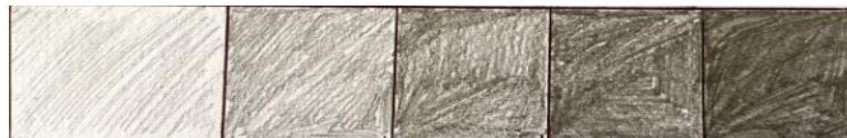
Tone with pencil