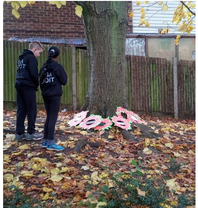
Laying the wreaths that each class made,, reading poems, singing and showing respect.