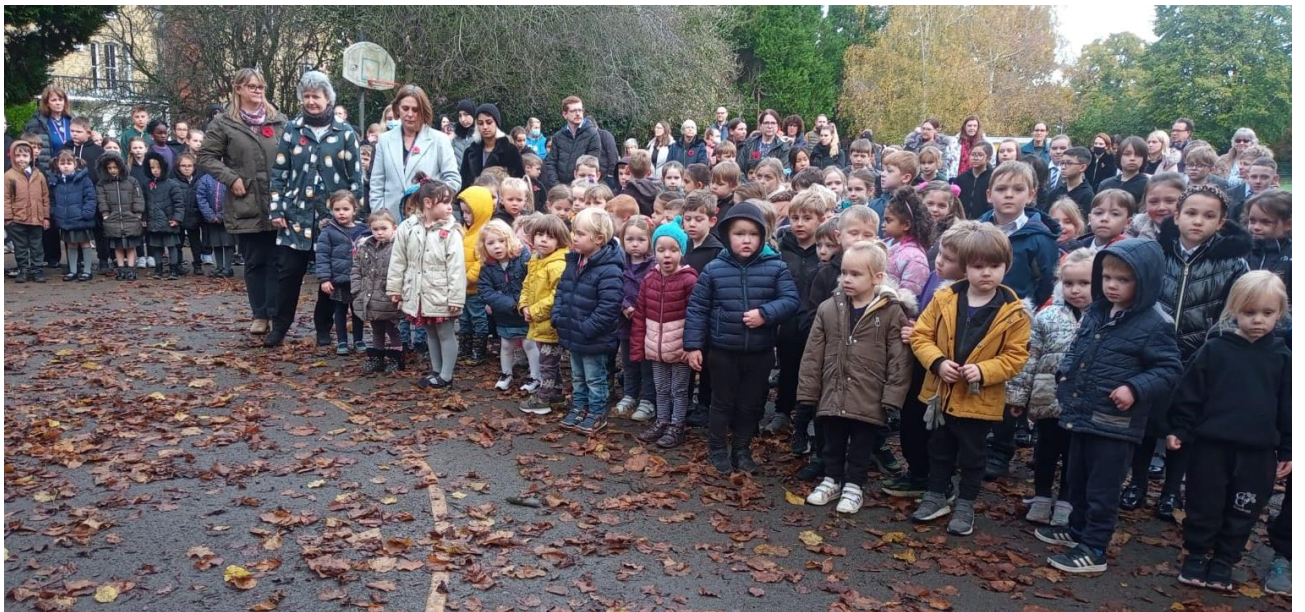
Bringing the whole school together