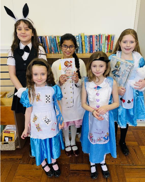
Down the rabbit hole with Alice in Wonderland!